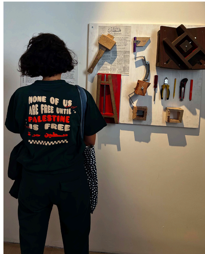
Everyday tools of repair, are displayed at the Venice International Architecture Biennale 2025, demonstrate the possibilities of construction with available materials.