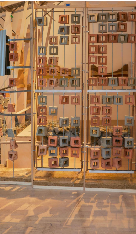
"Objects of Repair," an exhibition currently on display at the Venice International Architecture Biennale 2025, is an exploration of alternative methods of construction that use clay and crushed concrete as tools to create a cooling skin and an outer skin.

access for professionals, experts, and helpers who wish to enter Gaza and participate in self-help initiatives alongside Gazan residents and institutions.